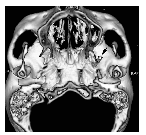
Fig. 2 Reconstructed three-dimensional image shows the rhizotomy needle (arrow) in the left foramen ovale.

lesioning depended on the reproduction of paresthesia upon stimulation, covering the distribution of a specific division of the trigeminal nerve. The lesion at the Gasserian ganglion was made by radiofrequency thermocoagulation (Radionics, Inc. Burlington, MA, U.S.A.) at 60°C for 60 seconds under propofol sedation without intubation.