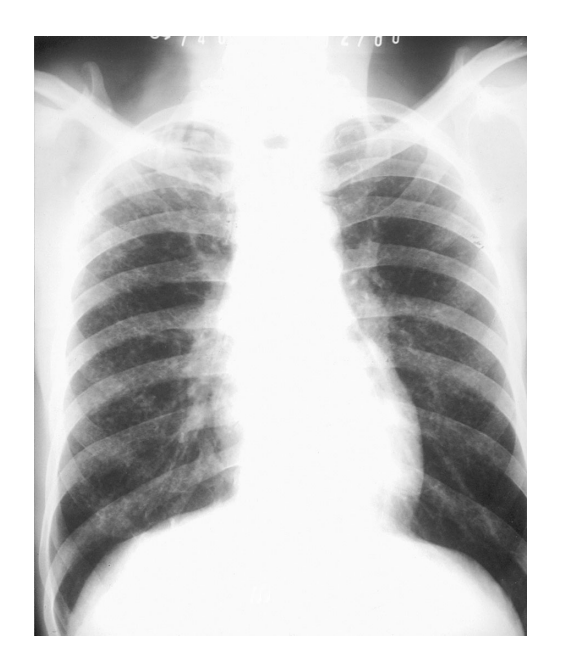
Fig. 1 The chest radiograph of a 57-yr-old coal miner with category 2 CWP. Note the numerous fine nodular (diameter = 2 mm) shadows in both lungs and emphysematous changes in the bilateral lower lung fields. The lung markings are obscured. Results of lung function study showed the following: FVC = 97%p, FEV = 71%p, FEV1/FVC = 68%, TLC = 113%p, RV/TLC = 39%.