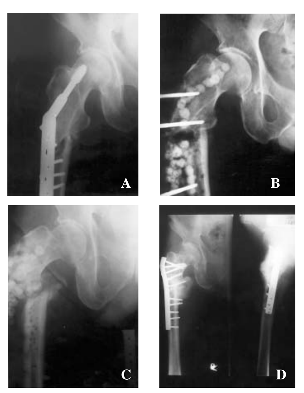
Fig. 1 Case 1. A 64-year-old male with diabetes had suffered from right pertrochanteric osteomyelitis for 8 months. (A) At presentation, the fracture was classified as an unstable Evans type with IVB (Cierny and Mader) osteomyelitis. (B) External fixation failed to stabilize the fracture with severe pin-track infection and loosening. (C) The patient then underwent multiple procedures to control infection. (D) The pertrochanteric infected nonunion healed after 7 operations.

compared with those managed with difficulty (Table 2). The average follow-up period was 55 months (range 24-156 months). At final follow-up, four (17.4%) cases (cases 1, 5, 8, and 11) revealed recurrence of osteomyelitis. Eight cases (cases 16 to 23)