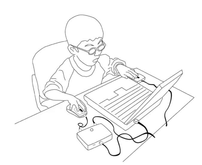
Fig. 2 A child with cerebral palsy operates a mouse via an Integrated Pointing Device Apparatus. The child uses the mouse for cursor control with his dominant hand and uses an external switch for click control with the other hand simultaneously.

tional performance of children with different disabilities.