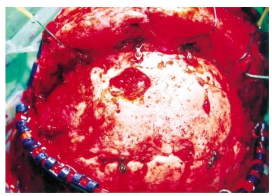
Fig. 4 Frontal bone graft reinserted back to its position, and fixed with miniplates.