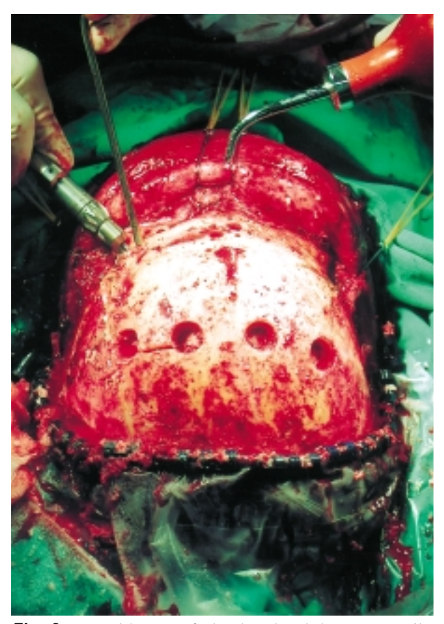
Fig. 2 Frontal bone graft developed and then temporarily removed.

After elevating the frontal base dura from the crista galli, we used a free pericranium graft to meticulously repair the dura in a watertight fashion. The galeopericranial flap was based on at least 1 side of the supraorbital and supratrochlear arteries and veins and was only raised from the scalp after the tumor had been removed (Fig. 3). The flap was turned inwardly and intracranially and was transposed to lie in the epidural space between the skull base bone and dura. It was fixed posteriorly by application of tissue glue, and was stabilized by nailing the flap on the sphenoid ridge or posterior wall of the sphenoid sinus. No free skin or bone grafts were used. Then the frontal bone graft was reinserted back into its position, and fixed with a miniplate (Fig. 4). The galeopericranial flap was turned inwards between the frontal bone graft and the supraorbital ridge. We left enough room between the frontal bone and the supraorbital ridge to allow an adequate blood supply. Then the scalp