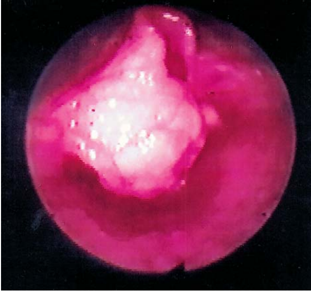
Fig. 1 A 2×2-cm pinkish mass covered with mucosa on the left aryepiglottic fold. The airway was partially obstructed.