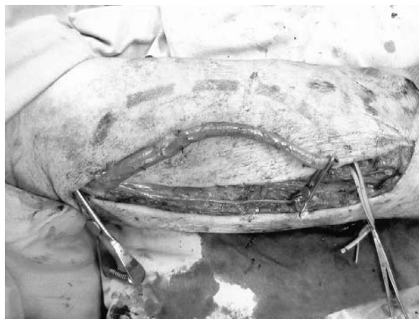
Fig. 1 Transposition of the basilica vein via the subcutaneous tunnel.

Under general anesthesia, the basilic vein of the upper arm was exposed through a medial longitudinal incision (with a mean length of 16 cm), similar to the approach described by Dagher et al. (4,5) Notably, the medial brachial cutaneous nerve is in close proximity to the basilic vein, and needs to be carefully separated from the vein during dissection. The branches of the vein were ligated. The basilic vein was mobilized up to its junction with the brachial vein. The anterior surface of the vein was marked to avoid axial rotation. A subcutaneous tunnel was created on the anterior aspect of the arm, maintaining its axial orientation, and the vein was passed through the tunnel. An end-to-side anastomosis to the brachial artery was created using 6-0 polypropylene sutures (Fig. 1). Additional care was taken to ensure hemostasis at the end of the procedure.