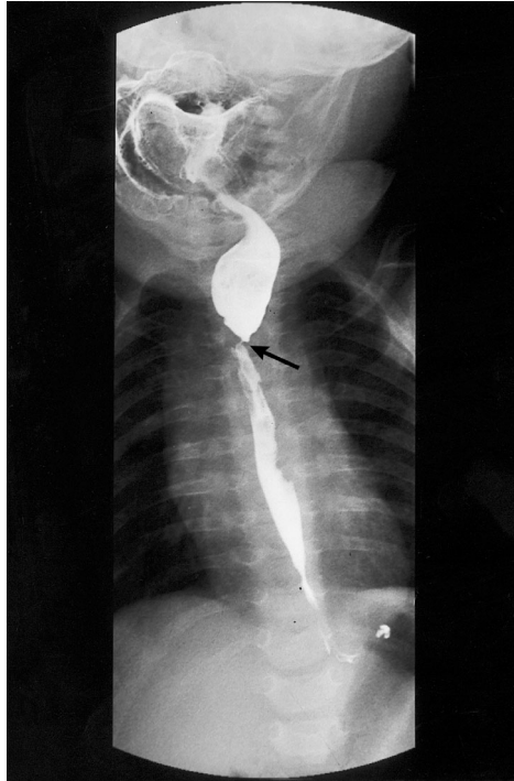
Fig. 1 Contrast study of the esophagus demonstrating esophageal stricture (arrow) before the dilatation procedure.

were inserted into the upper abdomen under the suspicion of tension pneumoperitoneum. The radiological examination revealed severe pneumomediastinum and pneumoperitoneum (Fig. 2). An esophagogram was not arranged because of the critical condition. An emergent right thoracotomy along the previous operative scar was performed through an