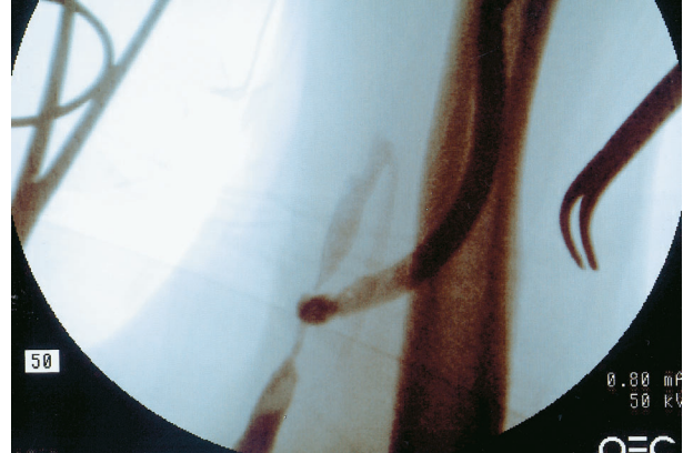
Fig. 1 Intraoperative angiography after thrombectomy showed a significant stenotic lesion over the venous outlet of dialysis graft.

Basic patient data was collected, along with the findings of angiography and the operative results. The patients were followed up for at least 6 months, and the primary patency of the grafts following salvage was calculated.