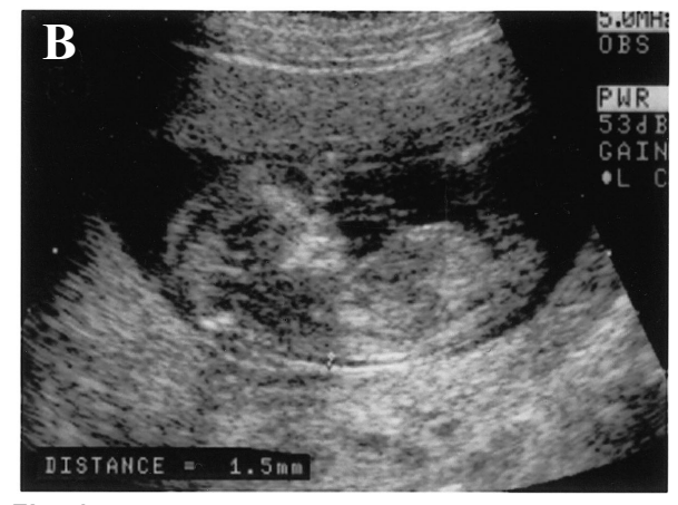
Fig. 1 Measurements of crown-rump length (CRL) and nuchal translucency (NT) thickness based on (A) a magnified image and (B) a standard image.