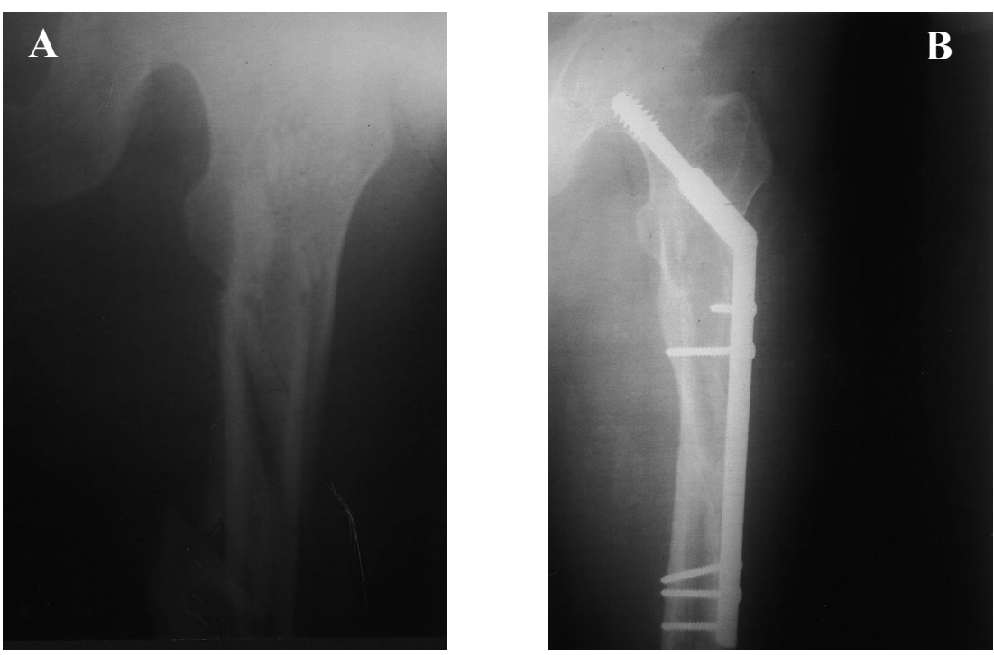
Fig. 2 Type 1 fracture (case 9) treated with a DHS using the bridge-plating technique. (A) Initial injury; (B) At 9 months.