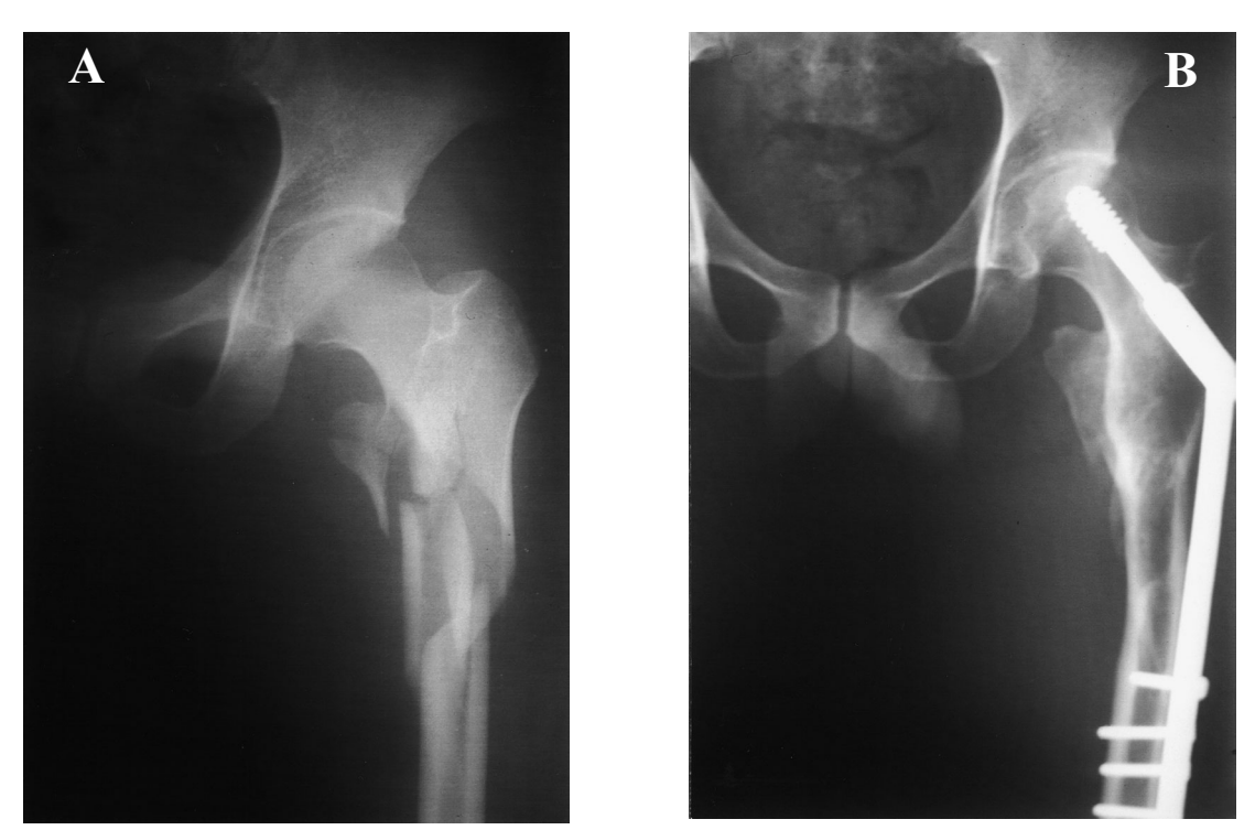
Fig. 3 Type 2 fracture (case 16) treated with a DHS using the bridge-plating technique. (A) Initial injury; (B) At 6 months.