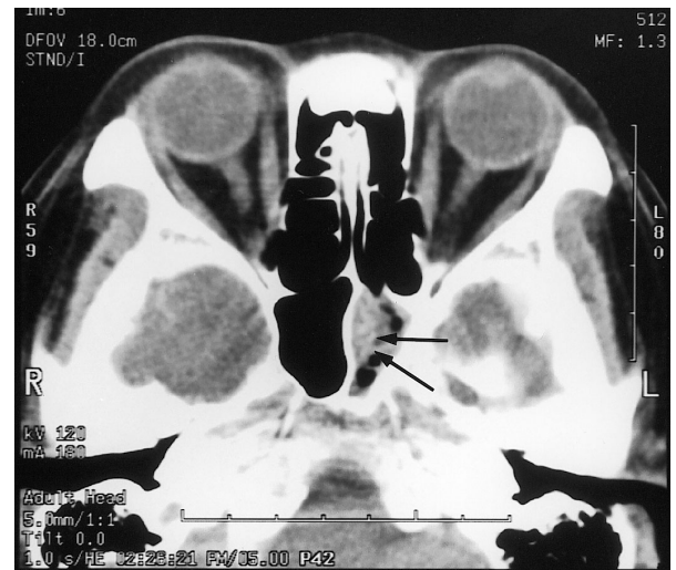
Fig. 2 Axial CT scan, in case 2, reveals opacification of the left sphenoid sinus. Dense particles within sinus are also observed (arrows).

fungal infection. Laboratory test results revealed blood glucose of 5.16 mmol/L (fasting) and anti-human immunodeficiency virus antibody test were negative.